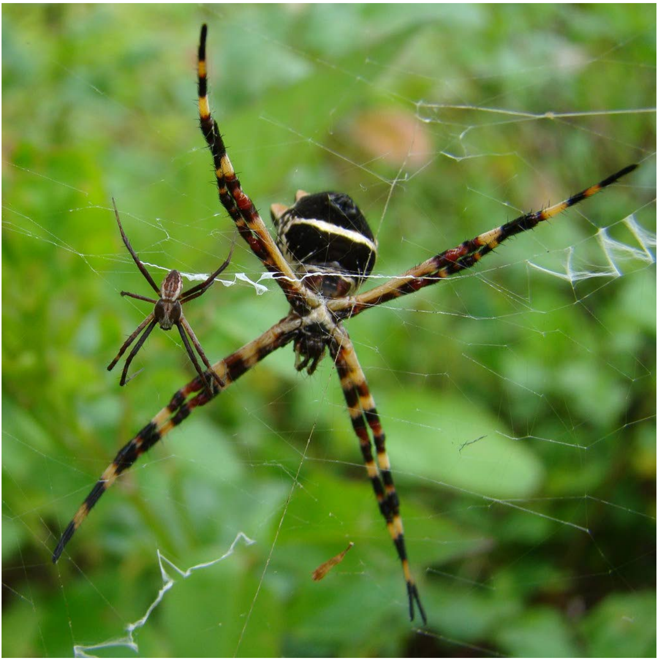
X-pattern web of the Argiope argentata.

Some of these giant webs are made through cooperation. There are approximately 20 species that show varying degrees of sociality. Anelosimus eximus is an example of a social spider species. Some of us may have seen this on hikes and have been told that they are tarantula webs. However, if you look at these webs close up, for example that of Philoponella republica, they are actually a collection of individual orb webs. The spiders form these combined webs because they can make more webbing to catch more prey and bigger prey.