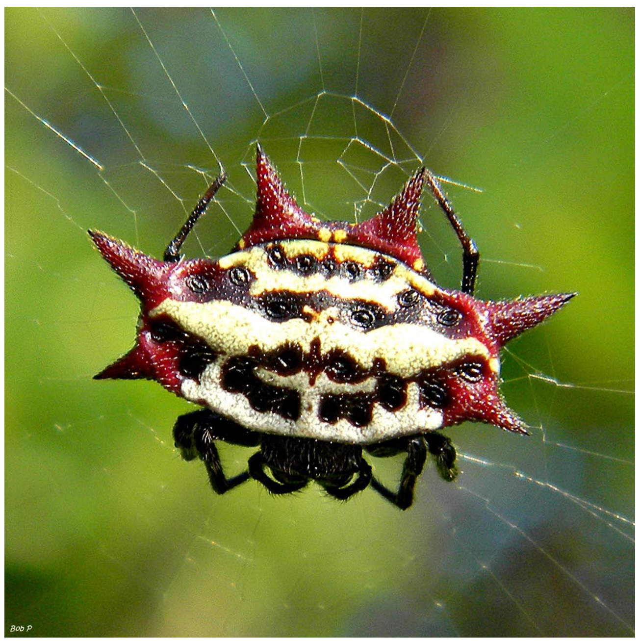
Gasteracantha cancriformis spins tuft-like webs.

I am also often asked, "Are spiders and their webs useful to humans?" Spider silk is the toughest material in the man-made and natural worlds. It is stronger than steel and stretches about eight times more than Kevlar (what bulletproof vests are made of). As a result, research is underway on the use of spider webs in bulletproof vest construction. Webs are also used in art, where paintings can be made using cobwebs as a canvas. In the past, spider webs were used in medicine as bandages – this is because they contain vitamin K which helps in blood clotting. In the South Pacific, spider webs are used as fishing nets. Fishermen make a wooden frame and a spider is introduced to build a web on the frame.